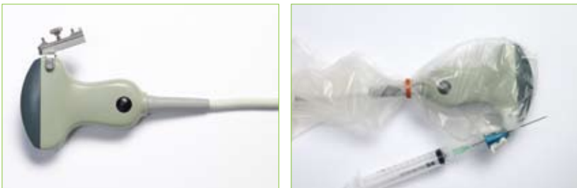
A reusable and a single-use needle guide are available to help make intervention easier.

The 8830's slim design and rounded handle make it easy to position the transducer accurately, and the small foot print makes even difficult areas easy to scan. Start and stop scanning and freeze and unfreeze images with a simple press on the integrated control button.