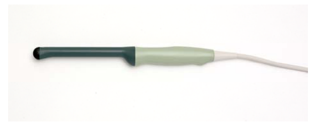
8819 endovaginal endfire transducer