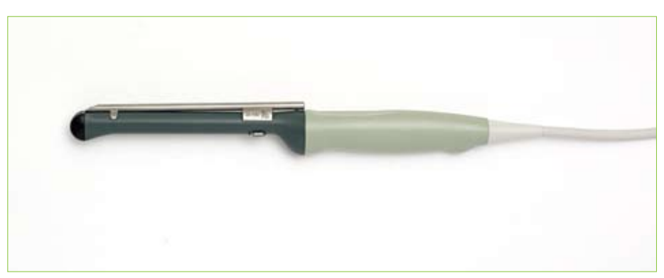
The 8819 needle guide helps simplify intervention.

Ergonomic and slim design for comfortable use. The 8819's long, slim design minimizes the discomfort of a transvaginal examination.